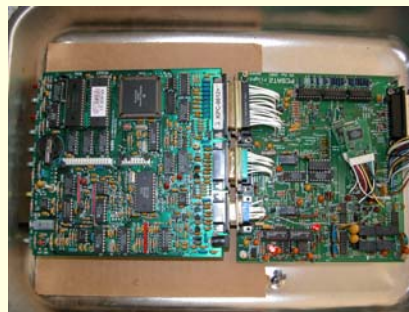
(see last slide)